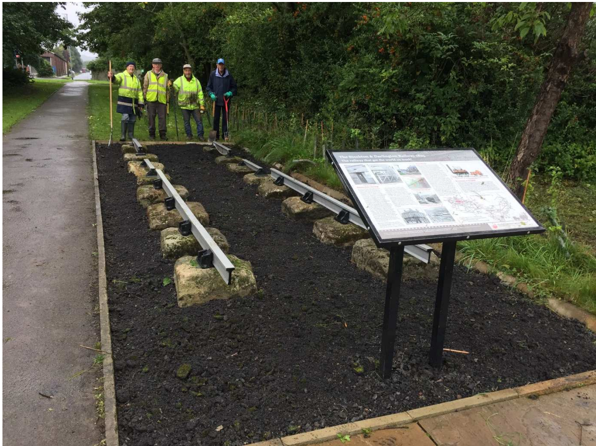
Photograph from the clean up event on the 16 th September.